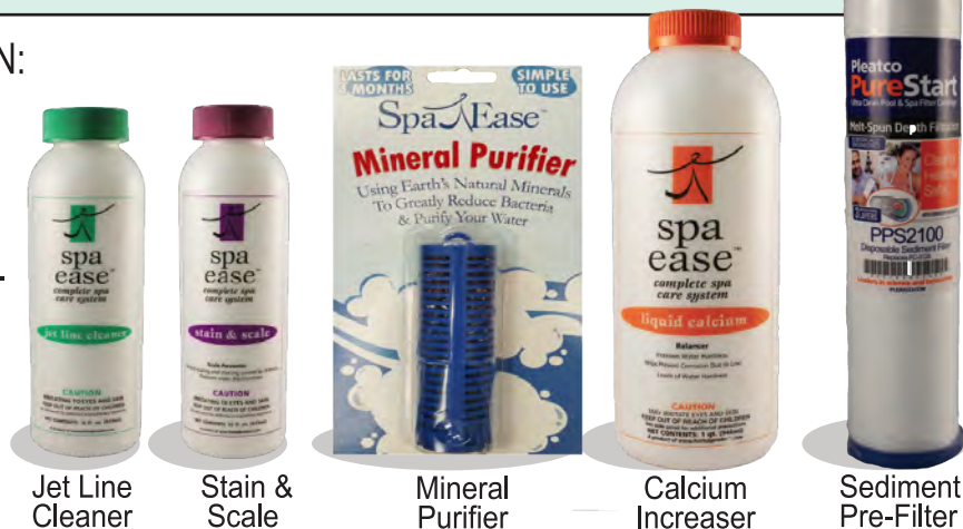
Jet Line Cleaner

RECOMMENDATION: Spa water should be drained and refilled every 3 to 4 months depending on usage. To accurately know when to drain use TDS Test Strips.